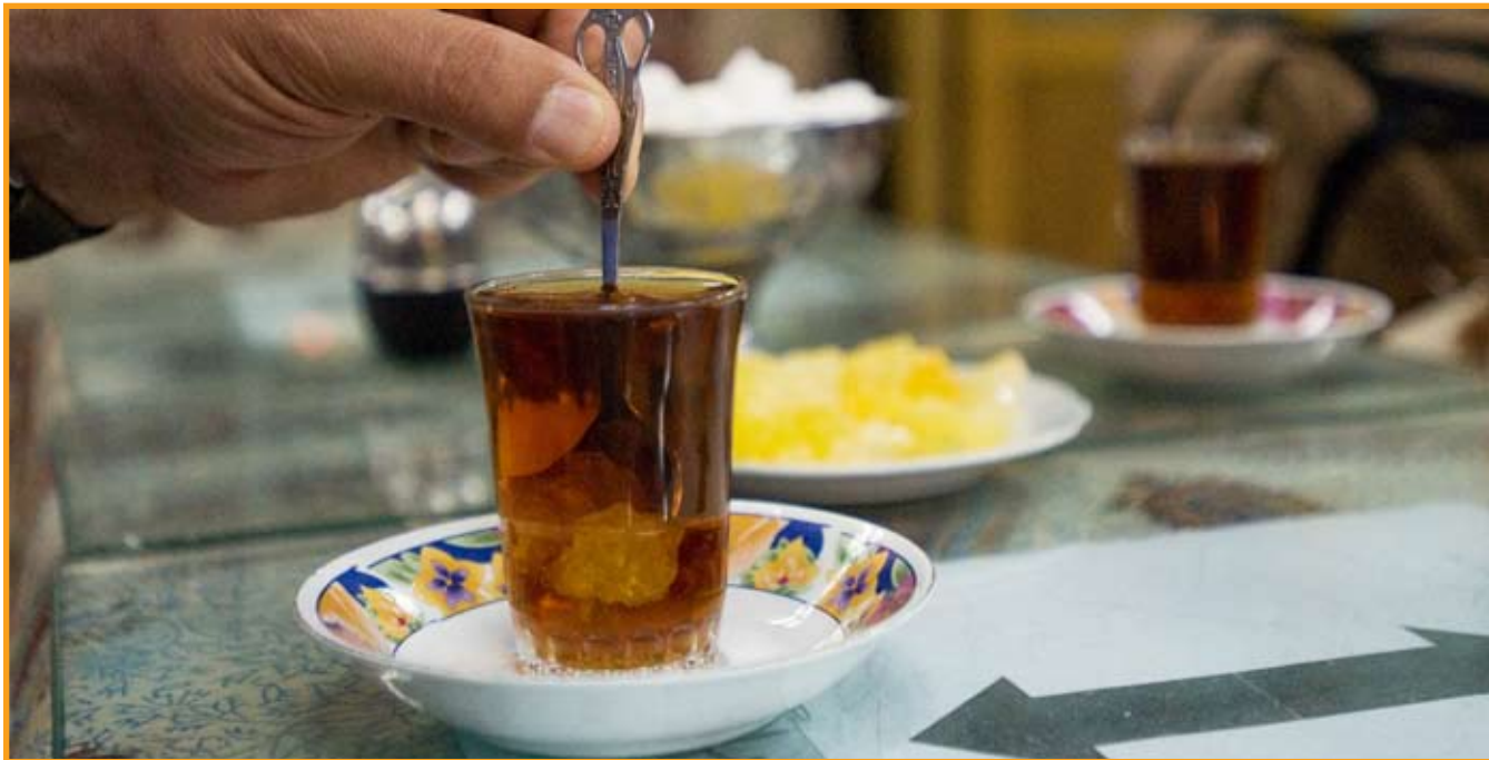
TEA TIME — A man stirs sugar into a glass of tea at a teahouse in Iran. It is common to hold the sugar cube in one's teeth while sipping the tea.